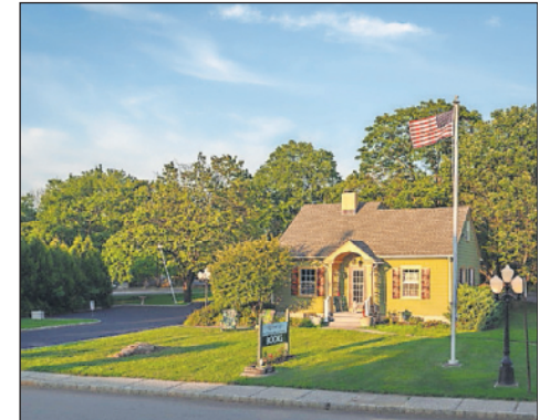
Peruse the catalogued book shelves while enjoying a free cup of coffee at Act 2 Books, located at 24 Central Station in Flemington.

Six days a week, except for Monday, you can peruse the catalogued bookshelves while enjoying a free cup of coffee at the store located at 24 Central Station from 11 a.m. to 8 p.m. on Tuesday through Saturday, with hours on Sunday from noon to 6 p.m. The vast selection is listed online at www.Act2Books.com as well. Non-perishable food