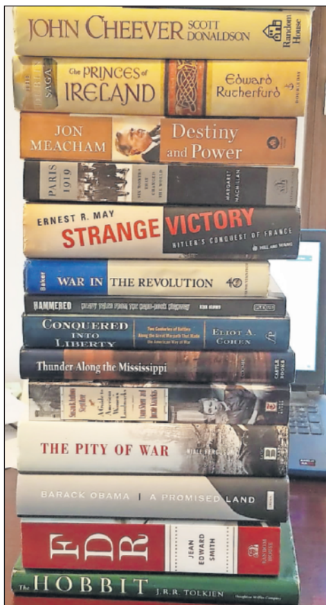
From Hollywood to horror to military history to Americana and anything in-between, every book is its own master work.

That quaint house on Central Avenue in Flemington with Victorian lamps dotting the property is actually a treasure trove for the discerning bookworm or collector.